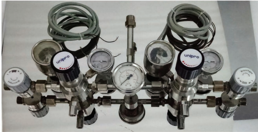
Auto Changeover Panel for Continuous Gas Flow